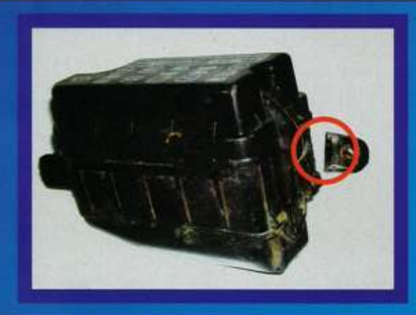
DISTRIBUTOR CAPS & ELECTRICAL COMPOMENTS