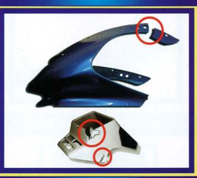
MOTORCYCLE SIDE PANELS