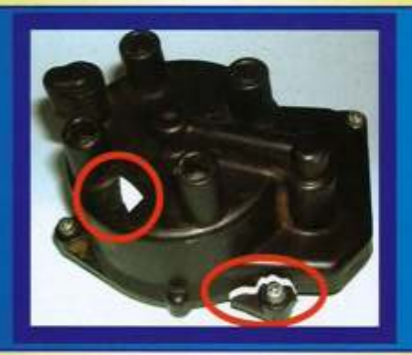
LUGS AND CLIPS