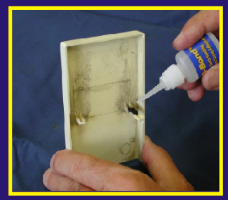
3. Saturate Q-Bond Powder with Q-Bond Super Glue